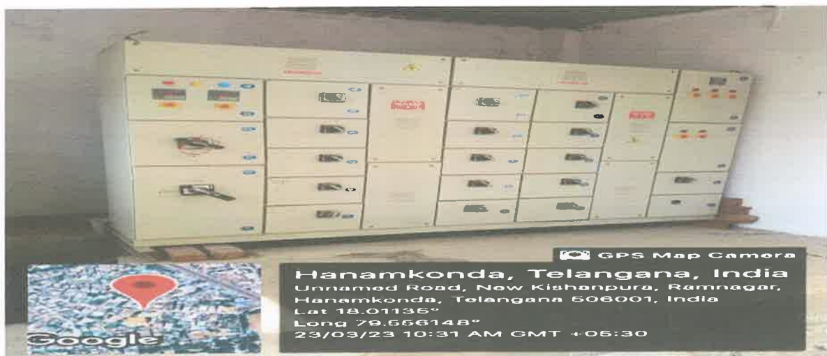
Wheeling to the grid